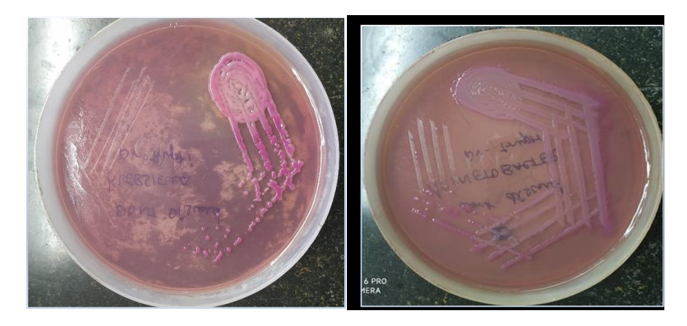
Figure 1: Biochemical reactions of K. pneumoniae

In conclusion, this study provides valuable insights into the epidemiology of BSIs in a tertiary hospital setting. It emphasizes the need for ongoing surveillance, effective diagnostic strategies, and antibiotic stewardship programs to manage BSIs effectively and reduce the burden of antimicrobial resistance. Furthermore, the results underscore the importance of considering age and clinical diagnosis in the treatment approach for BSIs.